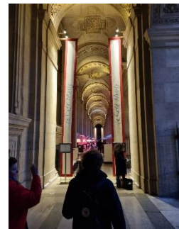
RILEM Dinner: the RILEM officers attending in person the Standing Committee meetings were treated with a dinner at “Le Café Marly”, next to the Louvre Museum in Paris.