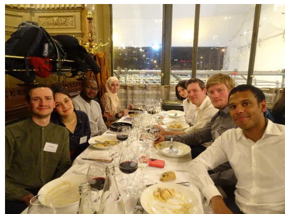
Some moments during the gala dinner at the restaurant "Le Train Bleu".