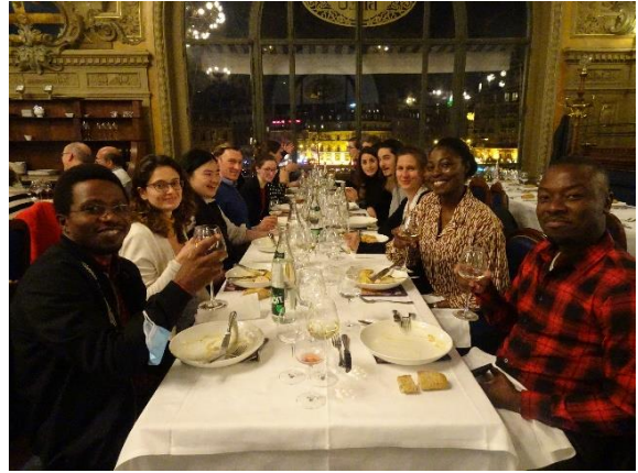
Some moments during the gala dinner at the restaurant "Le Train Bleu".