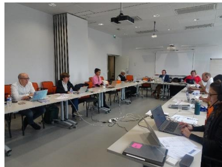
RILEM officers during a Standing Committee meeting.

At the EAC meeting, the agenda of the upcoming EAC events and the performance of the past events were reviewed. The ROC&TOK webinars stood out as a very successful series with high number of online participants and YouTube viewers. The proposal of the RILEM Youth Council to organise a new series of peer-to-peer webinars was enthusiastically welcomed and approved by the members of