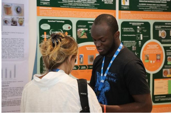
Young delegates presenting and discussing their posters.

The delegates were invited to a gala dinner at Wiener Rathauskeller, located in the cellar of the Vienna City Hall, with Viennese cuisine and seasonal delicacies.