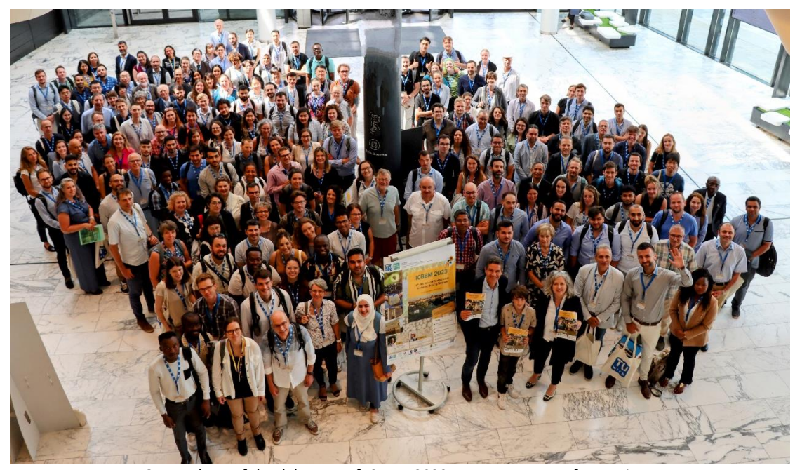
{\it Group\ photo\ of\ the\ delegates\ of\ ICBBM\ 2023.}

The conference continued online and onsite at the TWELVE conference centre on 21, 22 and 23 June. 255 participants from 40 countries attended the event. Other numbers are: 20 posters, 135 full papers, 8 key-note presentations, 1 booklet programme of 80 pages, Springer proceedings of 1033 pages (Bio-Based Building Materials, Proceedings of ICBBM 2023. Editors: Sofiane Amziane, Ildiko Merta, Jonathan Page. RILEM Bookseries, volume 45) and e-proceedings of 200 contributions!