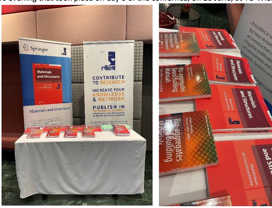
RILEM publications exposed at ICBBM 2023.

RILEM attended the event with a desk showcasing its publications. It also sponsored the RILEM Young Members evening that took place on day 0 of the confernce, on 20 June, at TU Wien.