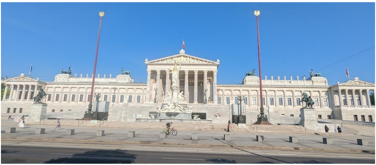
Austrian Parliament building in Vienna.

Everything started in 2015, with the <u>first edition of ICBBM</u> in Clermont-Ferrand, France. It was then the time for the <u>second edition</u>, still in Clermont-Ferrand, in 2017, followed by the <u>third edition</u> in Belfast, UK, in 2019. COVID didn't stop the series, as the <u>fourth edition</u> happened as scheduled in 2021 in Barcelona, Spain. RILEM has co-sponsored all these events and also the one this year, the <u>fifth edition</u> of this conference series, ICBBM2023, which was held in Vienna, Austria!