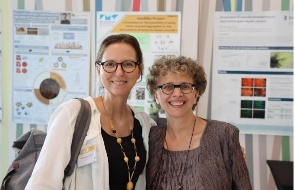
Some of the key-note speakers and invited lectures of ICBBM 2023.

The presence of young delegates was striking! Many were authors of posters that were presented during a Poster Flash talks session: only 2 minutes allocated to present each poster. It was dynamic, concise, and fun!