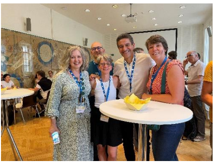
Some moments of the RILEM Young members event.

The conference continued online and onsite at the TWELVE conference centre on 21, 22 and 23 June. 255 participants from 40 countries attended the event. Other numbers are: 20 posters, 135 full papers, 8 key-note presentations, 1 booklet programme of 80 pages, Springer proceedings of 1033 pages (Bio-Based Building Materials, Proceedings of ICBBM 2023. Editors: Sofiane Amziane, Ildiko Merta, Jonathan Page. RILEM Bookseries, volume 45) and e-proceedings of 200 contributions!