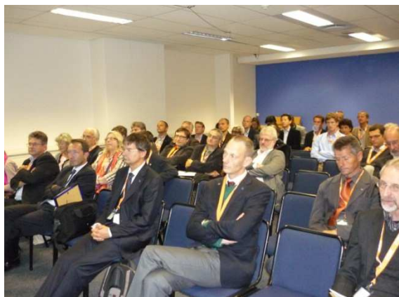
General Council, Cape Town, September 2012

This year's RILEM General Council can be named very special. On the one hand, due to lucky timing, this year's Honorary President and organizer of the local event has been elected RILEM President for the coming three years (see further). On the other hand, it was the first General Council ever giving voting right to all RILEM members present. In this way, the democratic nature of RILEM has been substantially strengthened once again, after the input of all RILEM members while selecting the new Vice-President last year (see further).