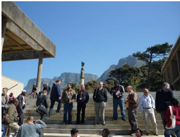
Networking on UCT Campus