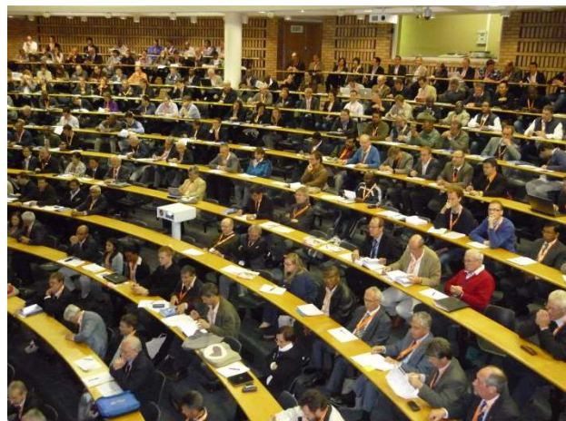
Full Lecture hall during the RILEM Annual Week in Cape Town

The 66 th RILEM Annual Week was organized in Cape Town, 3-5 September 2012, in conjunction with the International Conference ICCRRR 2012. The combined events attracted over 400 participants to the marvellous campus of UCT. In spite of the beautiful city and the appealing nature of Table Mountain and the Cape, lecture and meeting rooms were always nicely filled with an interested international audience attending the high-level presentations. Eleven RILEM Technical Committees had a meeting in Cape Town, in combination with several administrative meetings of RILEM Standing Committees. The technical work of RILEM has been clearly showcased during the RILEM Technical Day. A one year free RILEM membership will be given to all non-members attending the Annual Week in Cape Town.