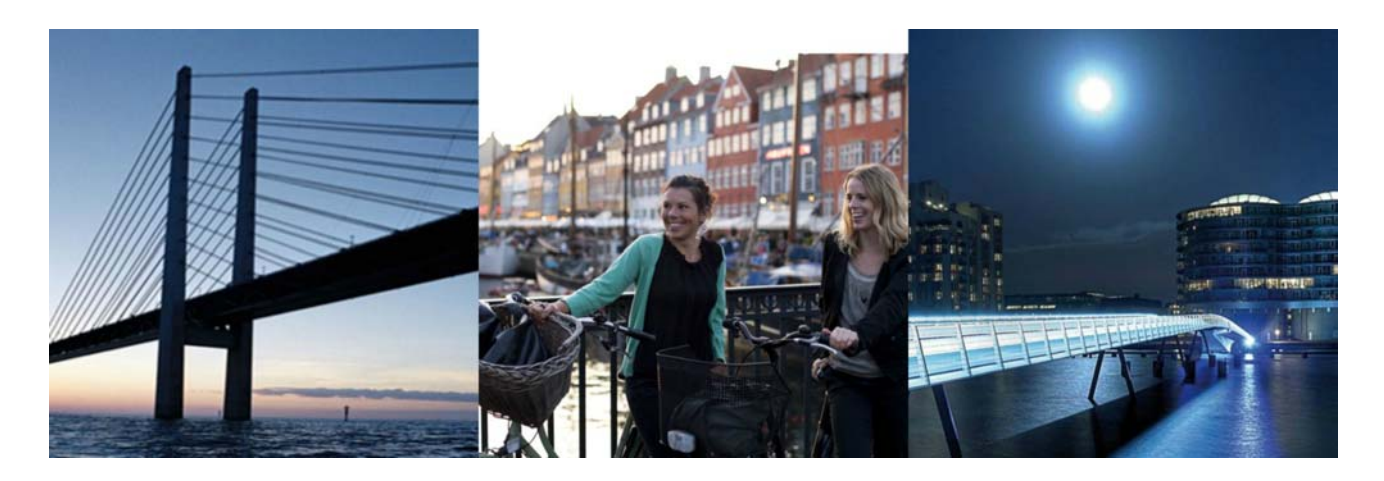
70th RILEM Annual Week 2016 in Lyngby, Denmark held in conjunction with the conference on Materials, Systems and Structures in Civil Engineering