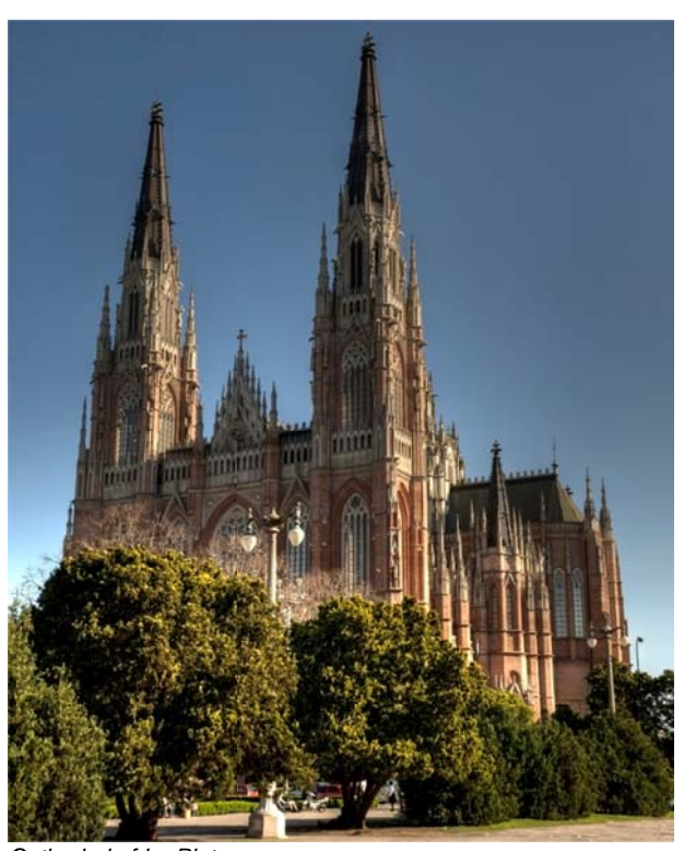
Cathedral of La Plata