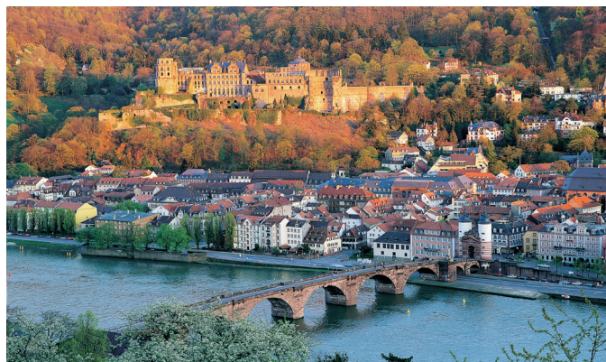
Heidelberg, Germany

If you need further information, please write an e-mail to info@ERICA-etn.eu or visit www.ERICA-etn.eu/ERICA-cash2-final-conference/