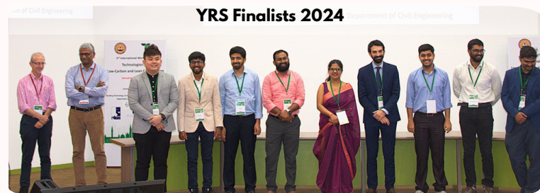
YRS Finalists 2024