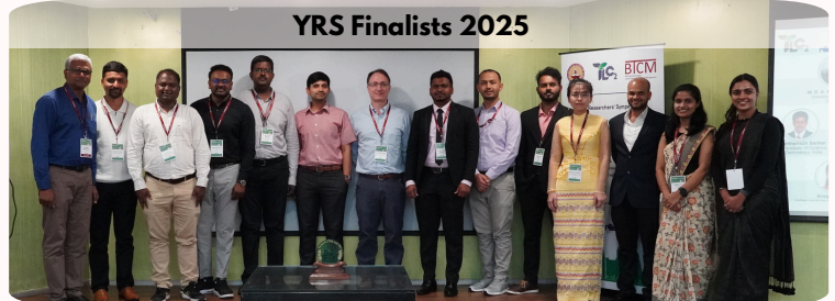
YRS Finalists 2025