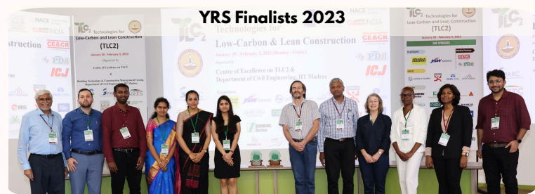
YRS Finalists 2023