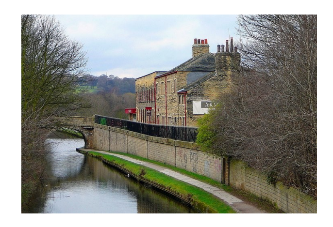
Leeds Industrial Museum—Armley Mills