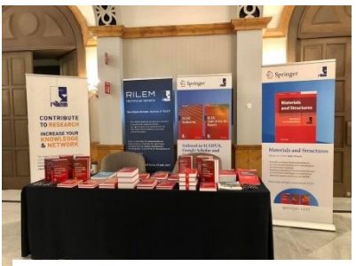
RILEM Publications corner at the conference venue.