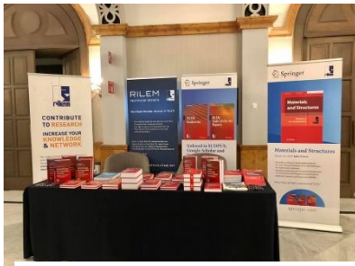
RILEM Publications corner at the conference venue.