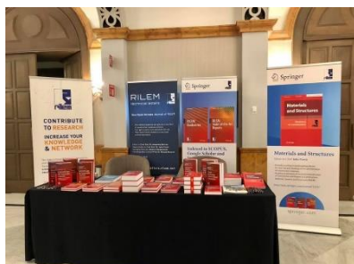
RILEM Publications corner at the conference venue.